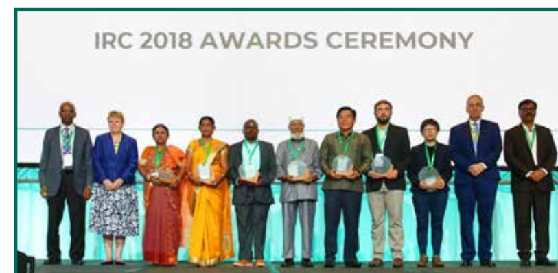
Exceptional rice scientists from all over the world were recognized with the awarding of the Young Scientist Award, the Senadhira Rice Research Award, and the Outstanding IIRI Alumni Award.