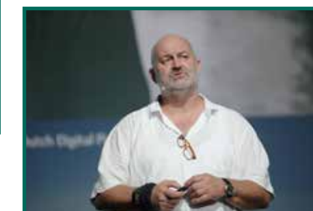
Amazon VP and CTO Werner Vogels shared how cloud computing and blockchain technology can help rice scientists and farmers.