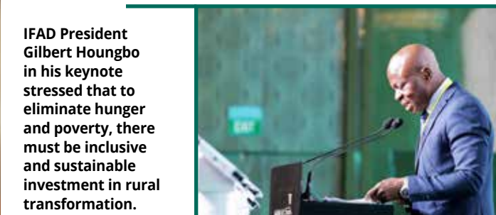
IFAD President Gilbert Houngbo in his keynote stressed that to eliminate hunger and poverty, there must be inclusive and sustainable investment in rural transformation.